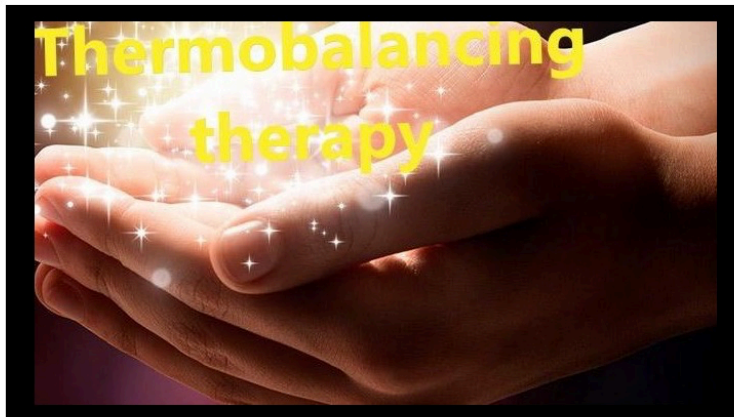
Thermobalancing therapy uses man's body energy to reverse BPH (Posted by Kathy Colace, Community Contributor)